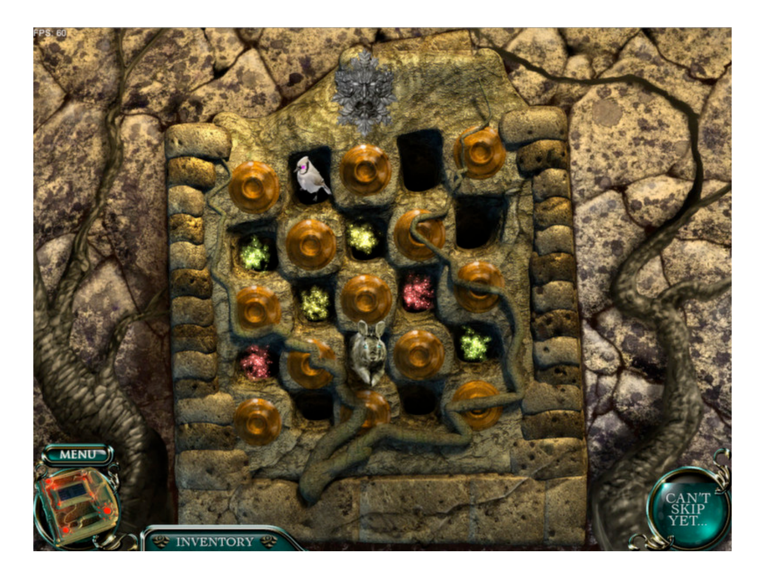
Empress Of The Deep 2: Song Of The Blue Whale Download Exe File